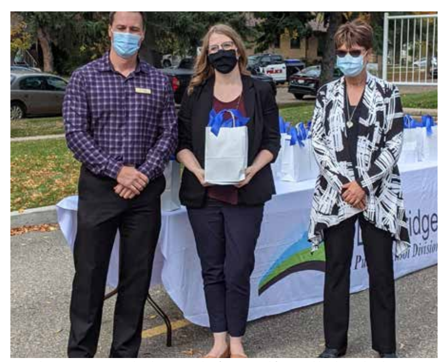
United Way was presented with a "Friends of 51" award from Lethbridge School Division 51 for the partnership with ATB Financial which made 66 laptops available for students as they navigated the transitions between in-school and at-home learning.