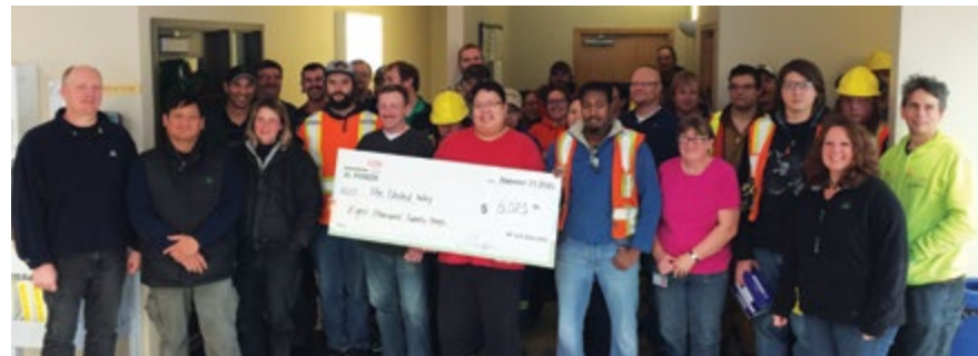
Above Left: Fantastic support for the community at Ashley Furniture Homestore with $2,000 raised! Thank you, team! Above Right: Employees at DuPont Pioneer blew their campaign goal out of the water by $1,000 and raised over $8,000 towards programs for people and families in the community. Thank you, everyone!